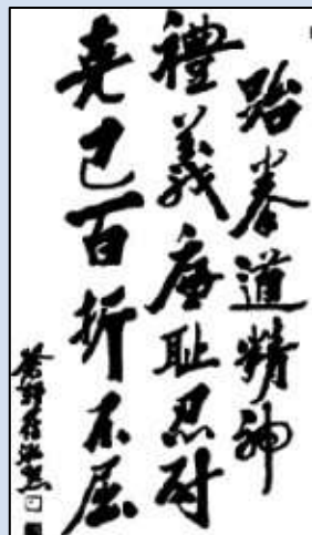
TENETS OF TAEKWON-DO General Choi, Hong Hi (Traditional Chinese Calligraphy)

The I.T.F. Student Oath represents the promise that students make to their Instructor; committing themselves to follow the teachings of TaeKwon-Do in an effort to act as role models, set an example for others and help to demonstrate the aims and ideals of the martial arts. This oath is extremely important to all of society as it is the means to which we can leave our mark and create an impact on others, motivating them to think before acting and to ensure that all of your actions are a credit to yourself, your family, your school and your instructor. The Student Oath outlines our goal of using TKD as a tool for social development, while the Tenets of TaeKwon-Do outline the tools we endeavour to use to achieve this goal.